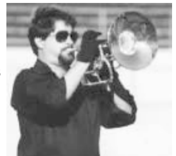
RENEGADES 2000 Pacific West Sr. Champion