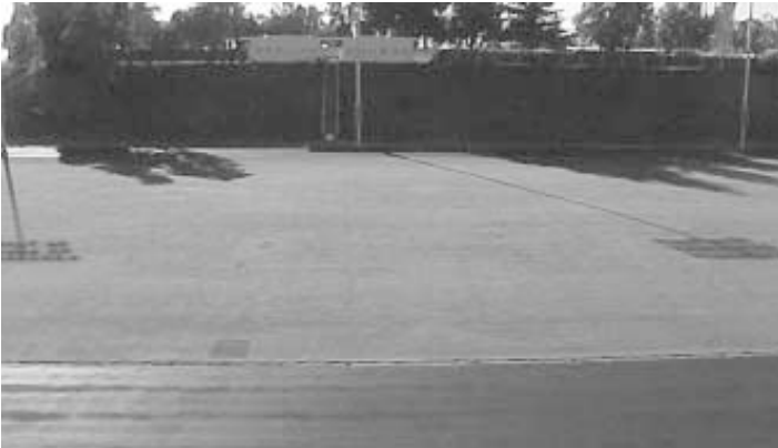
Gold Seating View