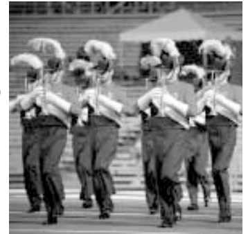
SANTA CLARA VANGUARD 6 Time DCI Champion