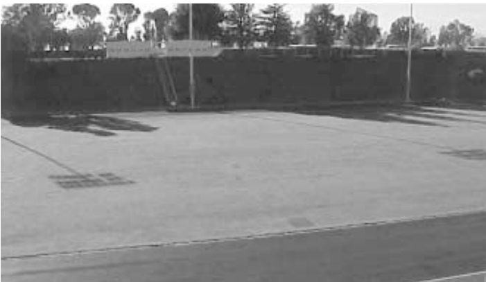
General Admission Seating View