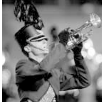
CONCORD BLUE DEVILS 10 Time DCI Champion