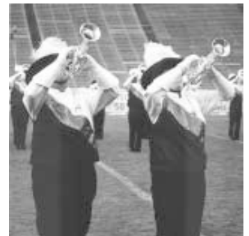
VANGUARD CADETS 2000 DCI Div. II Champion