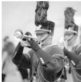
MANDARINS 7 Time DCI Div. III Champions